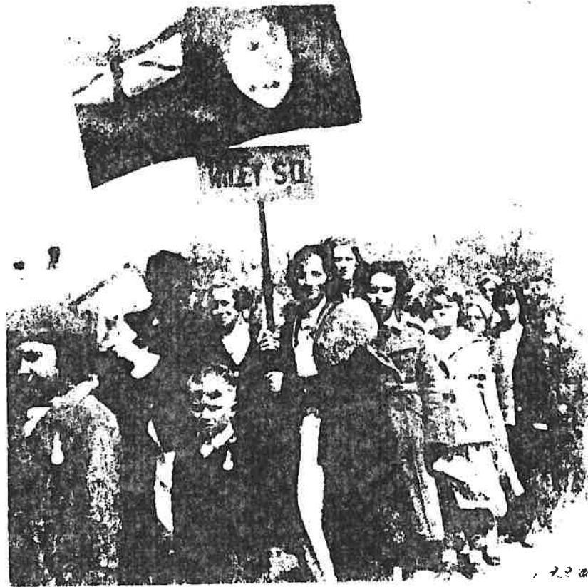
Children of Wiley School